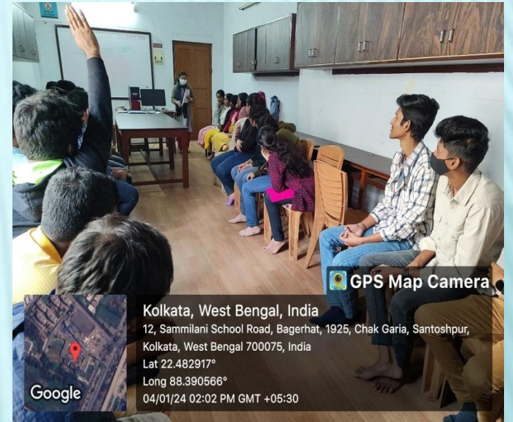
Quiz, Debate, Extempore competition and Departmental seminar organized by the Department of Science on 04.01.2024.