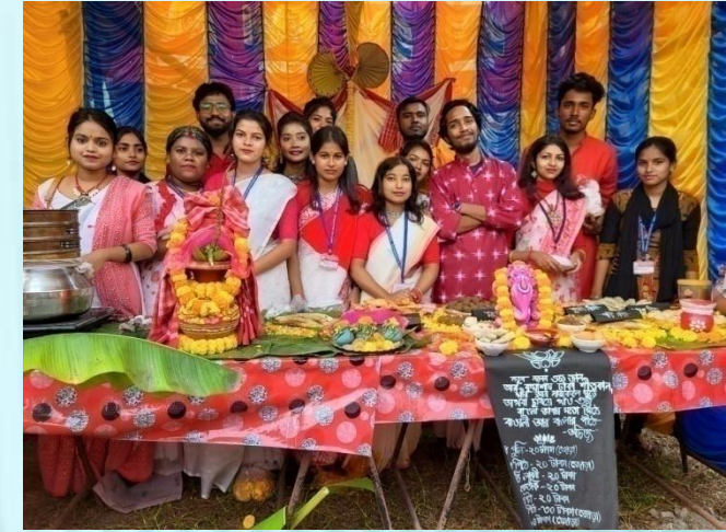
"Food Festival: A Savoury of taste"