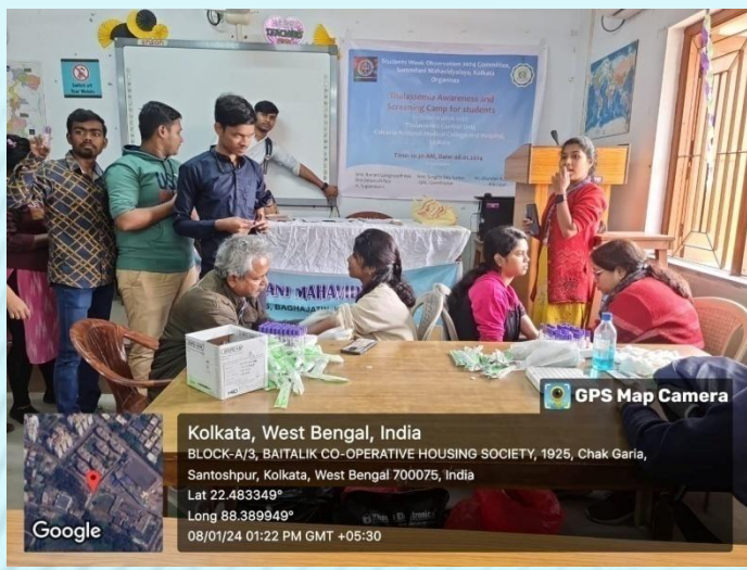
Health Awareness Camp on 08/01/2024.