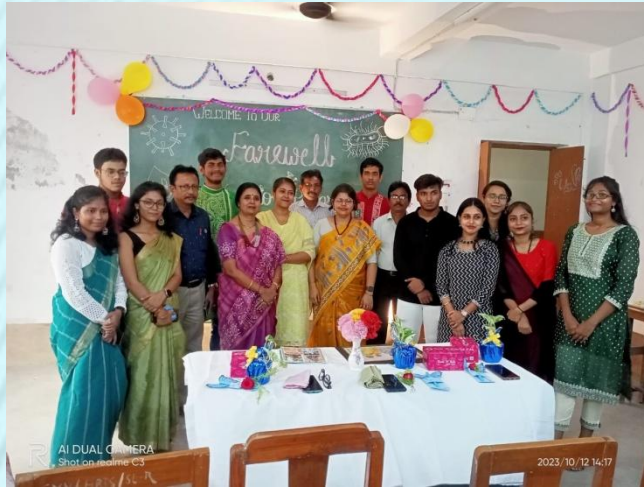
Department of Microbiology on 12/10/2023.