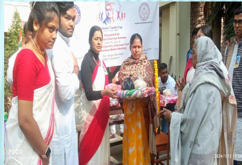
Distribution of blankets to the deserving people on the National Youth Day on 12/01/2024.