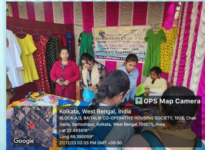
Exhibition and Sale of Sewing Art and craft