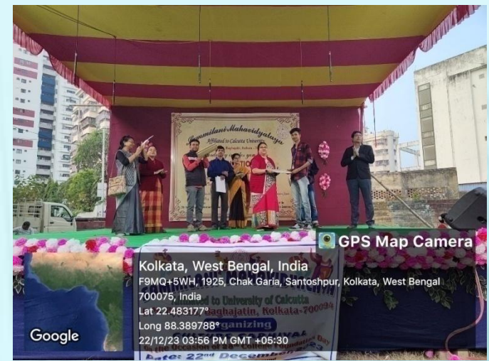
Prize Distribution of "Mathematics Olympiad"