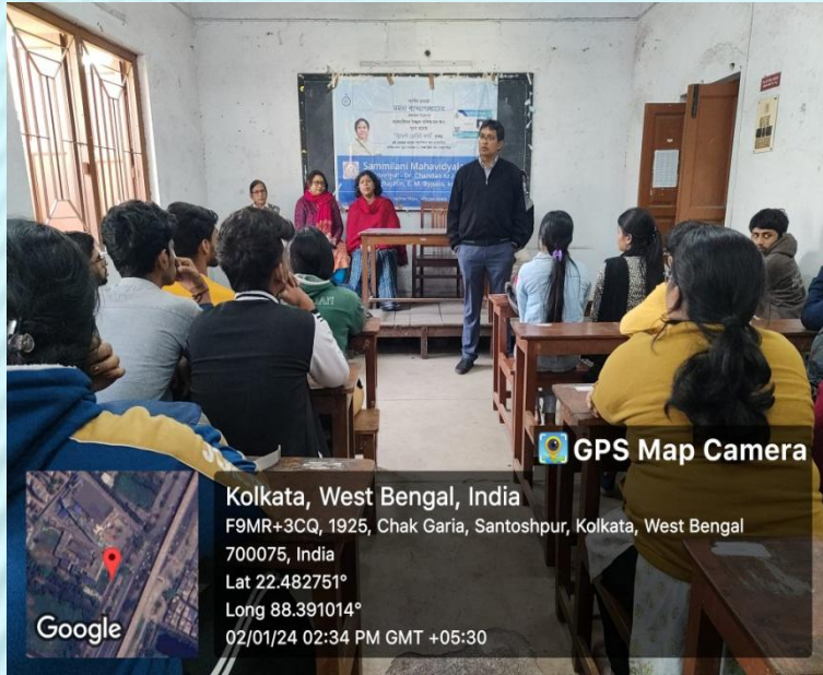
An Awareness programme was held on "WB Student Credit Card and other scholarships" on 02/01/2024.