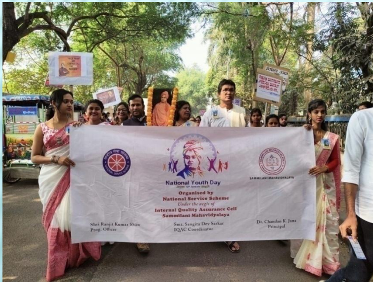
National Youth Day celebration on the occasion of the birthday of Swami Vivekananda on 12/01/2024.