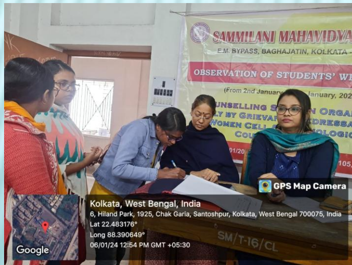
Counseling Session jointly organized by Grievance Redressal Cell, Women Cell and Psychological Counseling cell on 06/01/2024.