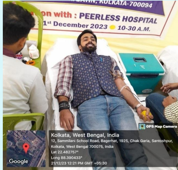
"Blood Donation Camp"