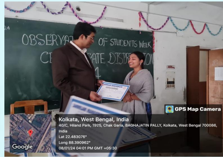
Certificate distribution of Quiz, Debate, Extempore and Photography competition on 08/01/2024.