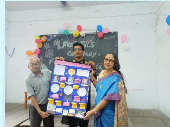
Publication of the wall magazines named "Resonance" of Department of chemistry on 12/10/2023.