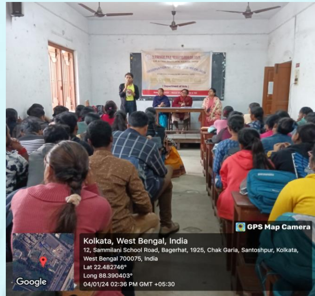
Quiz and Extempore organized by the Department of Arts on 04.01.2024.