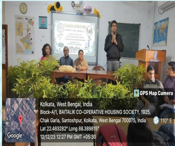
Plant Sapling Distribution Programme, called "Geography and the Society " was organized by the Department of Geography on 12/12/2023.