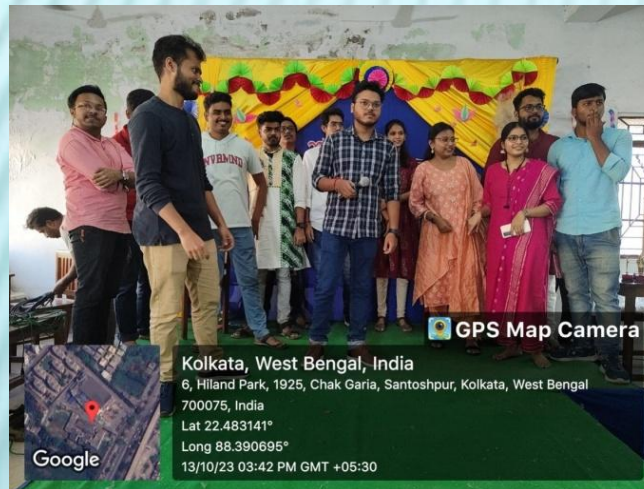
Publication of the wall magazines named "TechNext" of Department of Computer Science on 13/10/2023.