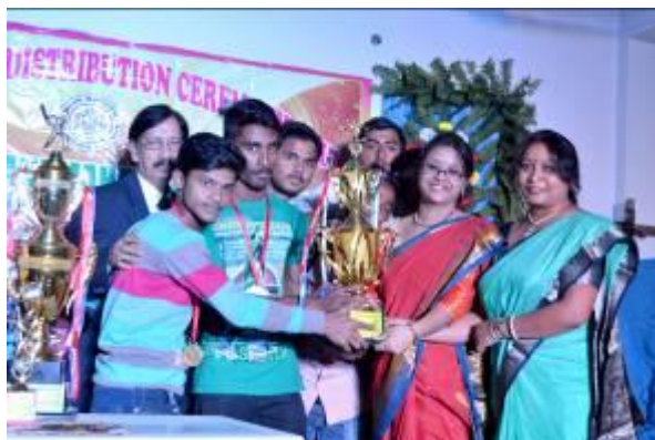
Annual Prize Distribution Ceremony

Fairs: State/ University level NIL National level NIL International level NIL Exhibition: State/ University level NIL National level NIL International level NIL