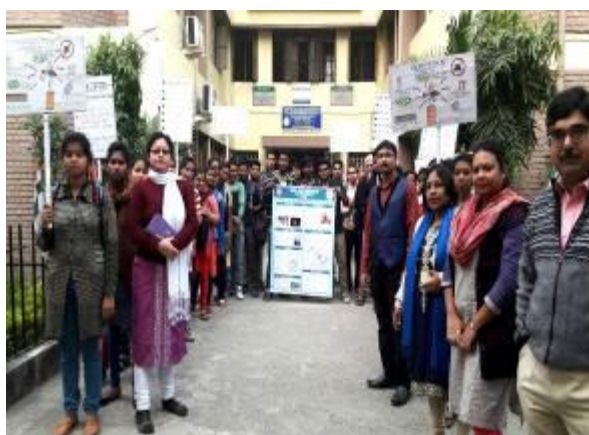
Rally to prevent Dengue